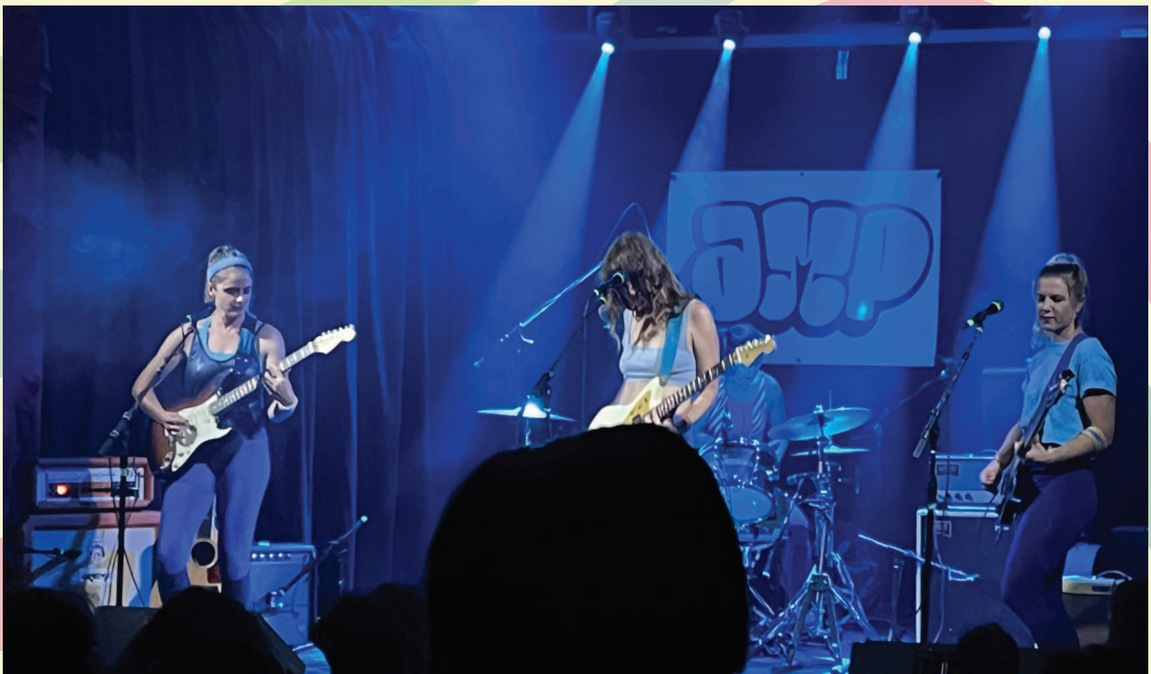
Pool Boys (2022)

For more information, please email us at info@amppdx.org .