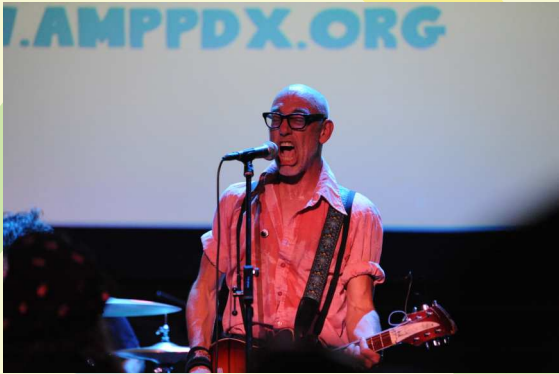
The Mistons (2024)